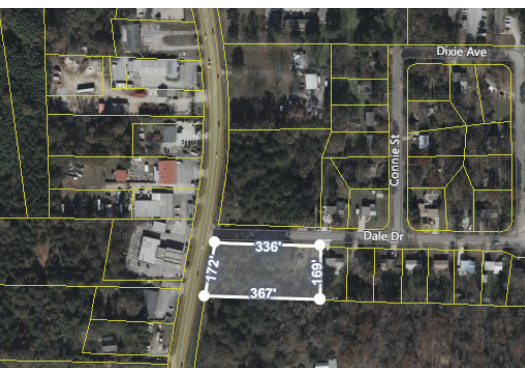
South Parcel 23-6-23-2-001-018.00