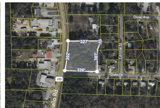
North Parcel 23-6-23-2-001-037.00